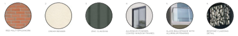
AS PROPOSED MATERIAL PALETTE