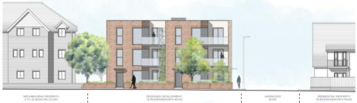
NEIGHBOURING PROPERTY: 5 TO 24 BOWLING COURT PROPOSED DEVELOPMENT: 73 RICKMANSWORTH ROAD HARWOODS ROAD RESIDENTIAL PROPERTY: 76 RICKMANSWORTH ROAD

THIS DOCUMENT IS AN PRELIMINARY DESIGN AND NOT A CONTRACT DOCUMENT. IT IS THE PROPERTY OF DAP AND SHOULD NOT BE REPRODUCED OR COPIED WITHOUT WRITTEN PERMISSION.