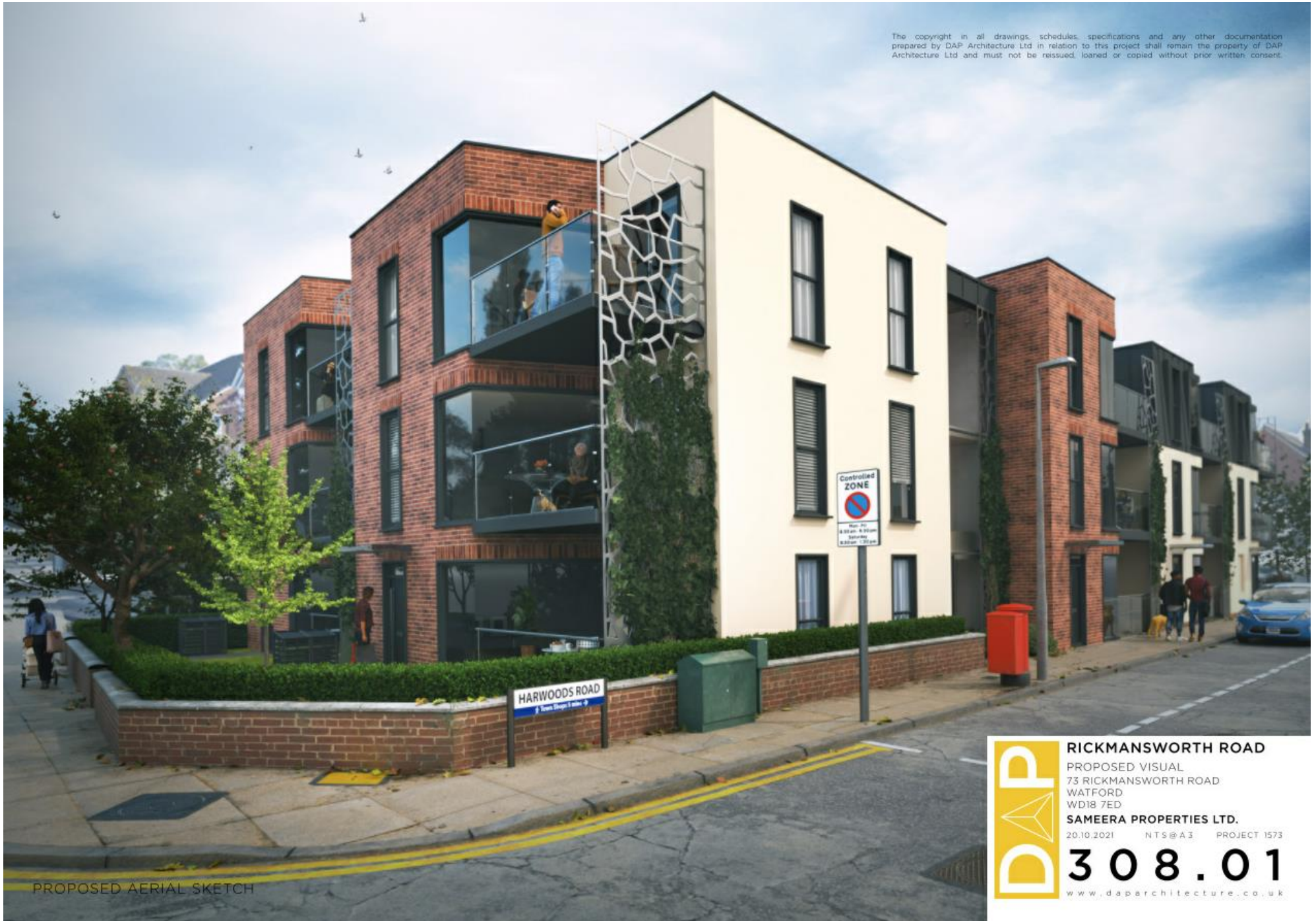
PROPOSED AERIAL SKETCH

The copyright in all drawings, schedules, specifications and any other documentation prepared by DAP Architecture Ltd in relation to this project shall remain the property of DAP Architecture Ltd and must not be reissued, loaned or copied without prior written consent.