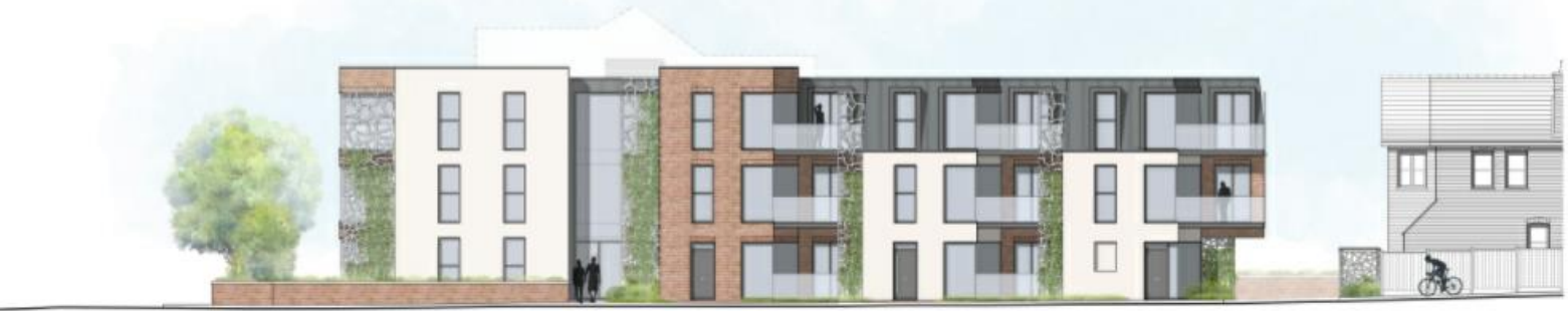
RICKMANSWORTH ROAD PROPOSED DEVELOPMENT: 73 RICKMANSWORTH ROAD NEIGHBOURING PROPERTY: 20 HARWOODS ROAD